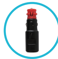
SAE TO CIG CABLE