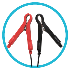
SAE TO ALLIGATOR CABLE