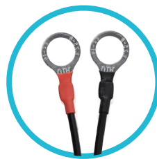
SAE TO RING CABLE